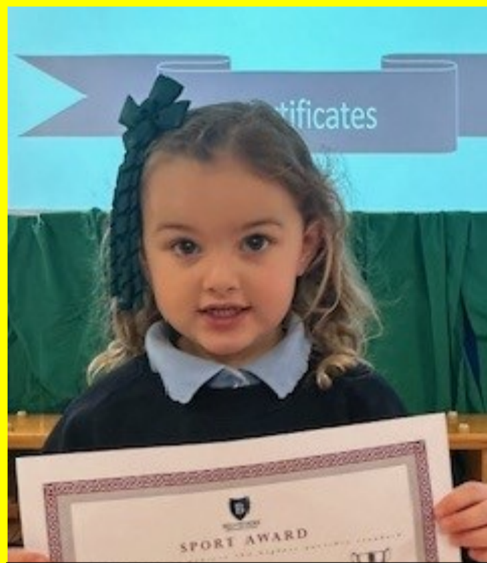
CONGRATULATIONS ROMIE SPORT AWARD