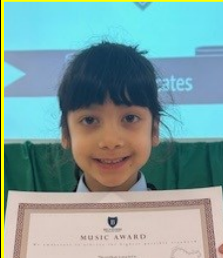
CONGRATULATIONS CECE MUSIC AWARD