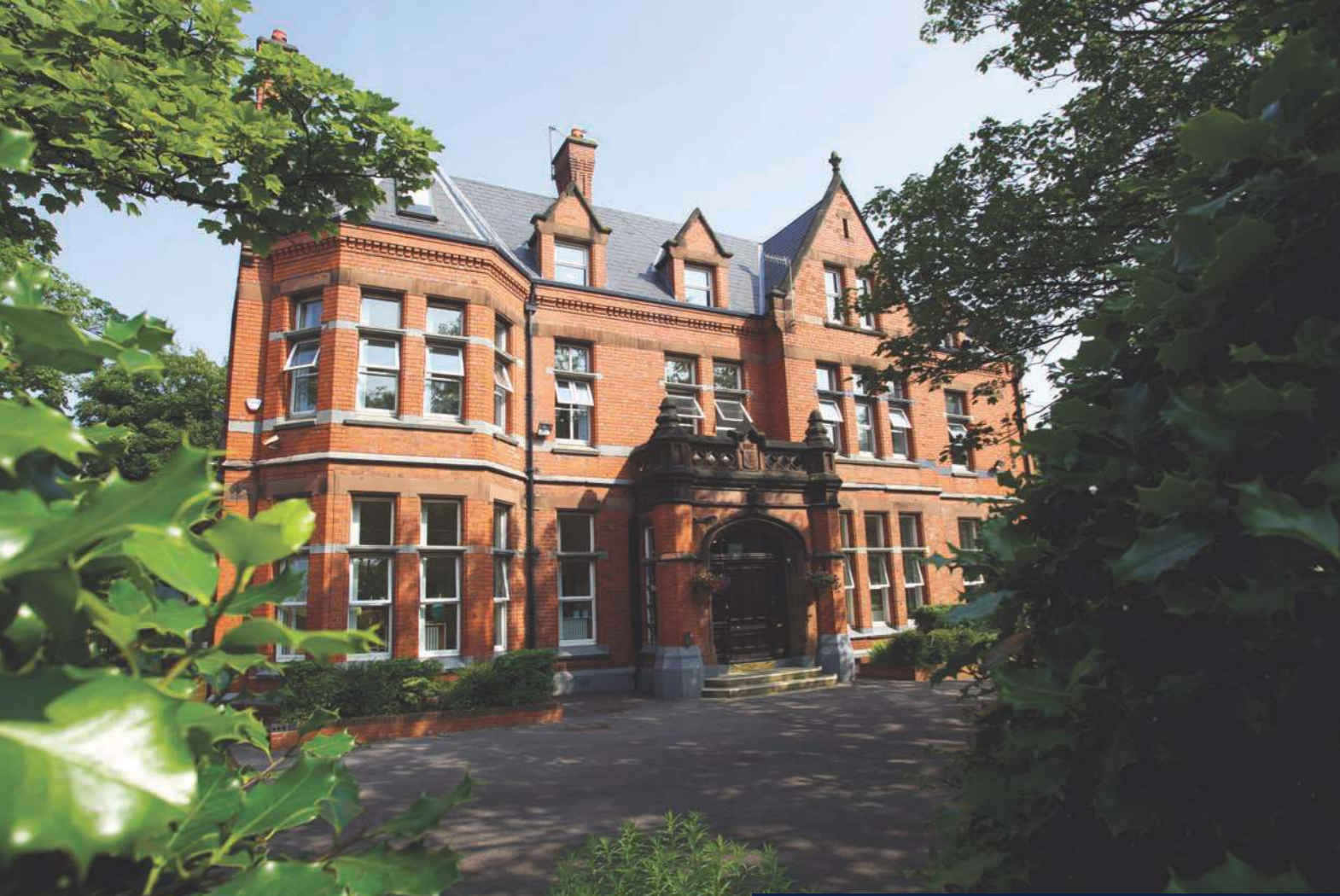
The Belvedere Preparatory School was originally founded in 1880